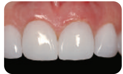
Individual results may vary.