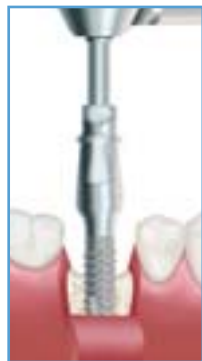
Implant insertion Fixture Mount Drill used to insert self-tapping implant.

SwissPlus implants are value-packaged with a fixture mount that functions as an impression post and preable final abutment.