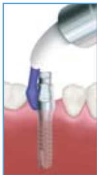
Transfer impression Block out the top of the transfer to make a conventional impression.