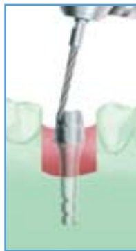
Preable final abutment Shorten and prepare the Fixture Mount/Transfer for use as an abutment.

Prices subject to change without notice.