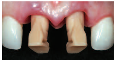
Fig. 2 Color-coded Contour Impression Caps