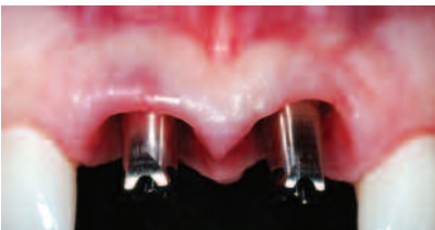
Fig. 1 Hex-Lock Contour Abutments