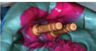
Fig. 4 Contour Abutment Analogs