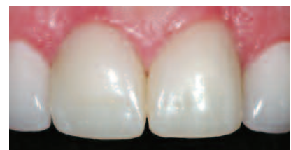
Fig. 6 Provisional restorations cemented into place

Individual results may vary.