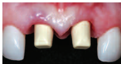
Fig. 5 Contour Provisional Copings on Hex-Lock Contour Abutments