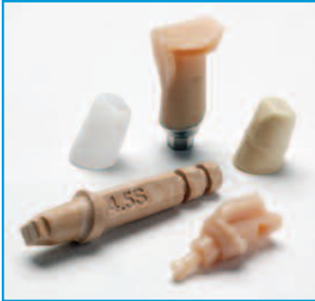
Contour Restorative Components

Hex-Lock Contour Abutments feature a pre-defined offset margin that is lower on the buccal aspect and higher on the lingual aspect. The abutments are contoured below the margin to create space for soft tissue without compromising strength. To resist rotational forces, the abutment's cone is non-cylindrical and features a vertical groove on the lingual aspect. Cuff height options include 1mm, 2mm and 3mm (buccal measurement) on the straight abutment and 1mm and 2mm on the 17° angled abutment.