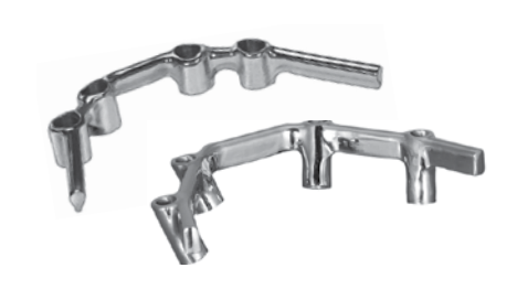
BellaTek Hader and Dolder® Bars

DCATOR® ABUTMENT AND TACHMENT COMPONENTS